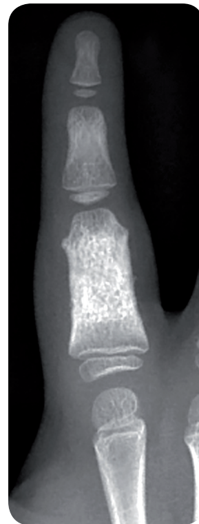
Post-op 24 months